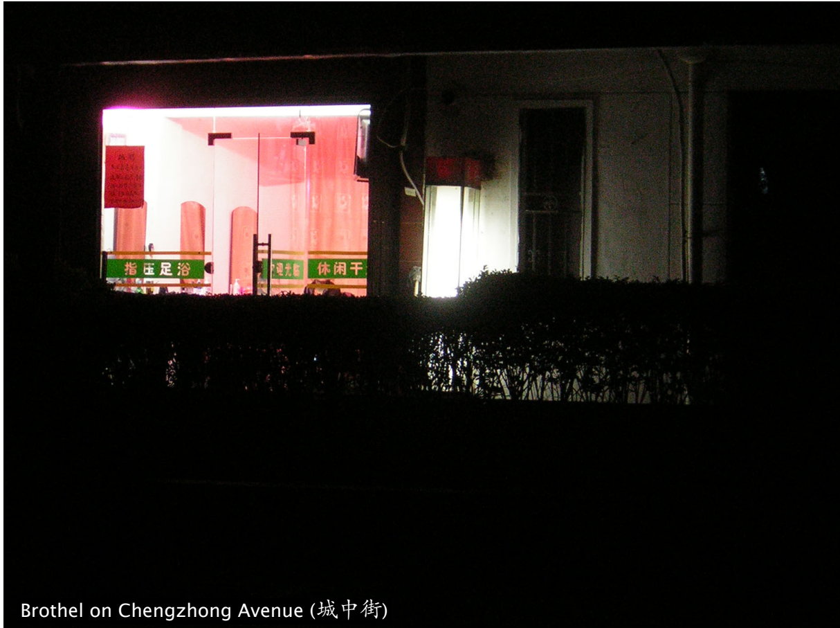
Brothel on Chengzhong Avenue (城中街)

zontal east-west stretch along the Qilian River is particularly populated with brothels, especially on the ancient People's Avenue (人民街, Rénmín jiē) with extensions, and also along the parallel Clear River Road (清河路, Qīnghé lù). The northern part of the City Ringroad (环城路, Huánchéng lù), and the area around the southern Fuhai Road (福海路, Fúhǎi lù) and Yumin Road (裕民路, Yùmín lù), are also hosting clusters of brothels. Other venues for prostitution are scattered here and there.