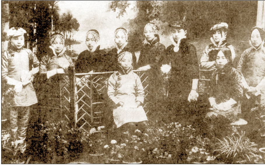
Shanghai's ten most famous courtesans at the end of the Qing dynasty