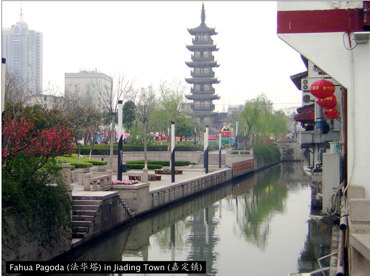
Fahua Pagoda (法华塔) in Jiading Town (嘉定镇)

although parts of them were reconstructed in 1994. Wuxing Temple is open for tourism since 1995, and is a sight of eternal burning of incense.